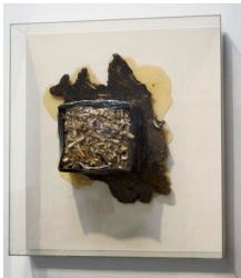
Arman Farhi's Ashtray , 1966 Accumulation of cigarette butts and matches in an ashtray, covered with polyester on wood panel 15 3/4 X 9 7/8 inches (40.01 X 25.08 cm)