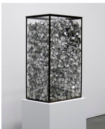
Arman Les Petites Gourmandises (Papiers Gateaux) , 1961 Aluminum, glass, metal 36 1/2 X 21 X 15 1/4 inches (92.71 X 53.34 X 38.74 cm)