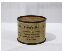
Piero Manzoni Merda d'artista N.10 , 1961 Tin box and paper 1 7/8 X 2 3/8 inches (4.8 X 6.1 cm)