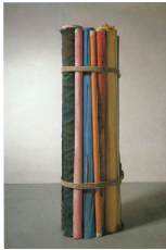
Michelangelo Pistoletto Il Fascio della Tela , 1980 Painted canvases and string 84 1/4 X 27 1/2 inches (214 X 70 cm)