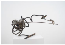
Jean Tinguely Le Perforateur , 1963 Welded iron, painted rubber, nuts, bolts, electric motor (110V), wire and transformer 21 X 44 5/8 X 24 1/2 inches (53.34 X 113.35 X 62.23 cm)