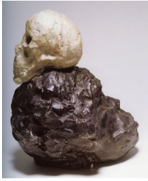
Rosemarie Trockel Trophäe der Sehnsucht , 1984 Painted plaster 7 7/8 x 7 1/8 x 7 1/2 inches (20 x 18 x 19 cm)