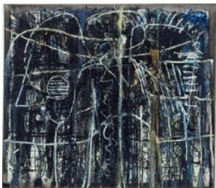
Night World , 1948 Oil on linen 55 1/2 x 62 3/4 inches (140.97 x 159.39 cm)