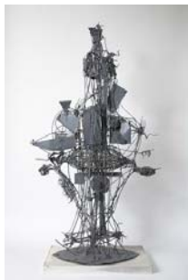
Creature of Clouds, 1949-1950 Steel wire and metal, painted 49 1/2 x 28 x 14 inches (125.73 x 71.12 x 35.56 cm)