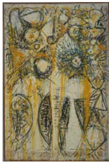
East River Sun, 1947-1949 Oil on linen 55 1/2 x 37 1/2 inches (140.97 x 95.25 cm)