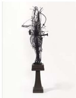
The Woman with a Horn, 1949-1950 Wire and metal 55 x 25 x 14 inches (139.7 x 63.5 x 35.56 cm)