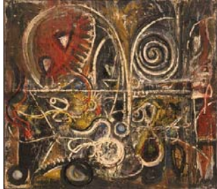
Animal Forms , 1940-1943 Oil on linen 38 1/2 x 42 inches (97.79 X 106.68 cm)