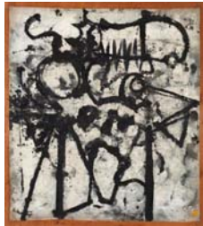
Dragon Head, 1948-1950 Oil on linen 43 x 38 1/4 inches (109.22 x 97.16 cm)