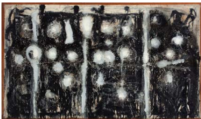
Ossi , 1949 Oil on linen 36 x 62 1/2 inches (91.44 X 158.75 cm)