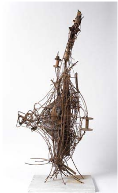
Arc of the Bird , 1950 Steel wire and metal objects 49 x 23 x 14 inches (124.46 x 58.42 x 35.56 cm)