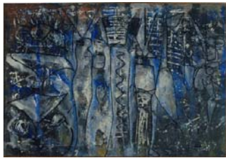
Angel Forms , 1952/1953 Oil on linen 44 x 63 1/2 inches (111.76 x 161.29 cm)