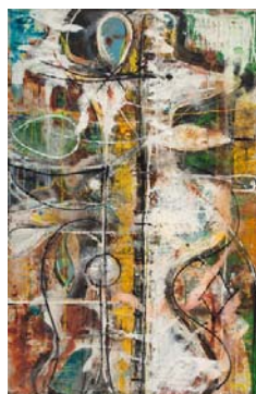
Bridge Horizon, 1950 Oil on linen 75 x 47 3/4 inches (190.5 x 121.29 cm)