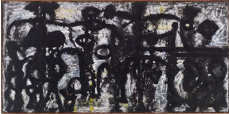
59th Street Ramp, 1947 Acrylic on linen 37 x 72 inches (93.98 x 182.88 cm)