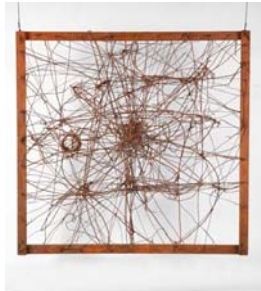
Untitled (The Web), 1950 Wire and found objects 50 x 50 x 18 inches (127 x 127 x 45.72 cm)