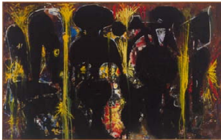
Ebony, 1951 Oil on linen 43 x 76 1/4 inches (109.22 x 193.68 cm)