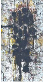
Number 19, 1951 Oil and metallic paint on linen 92 1/2 x 41 1/2 inches (234.95 x 105.41 cm)