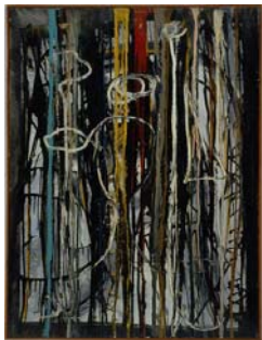
Allemande , 1951 Oil on linen 42 x 33 1/2 inches (106.68 x 85.09 cm)