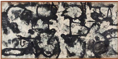
Cloud Sign , 1950 Oil and graphite on linen 36 x 74 inches (91.44 x 187.96 cm)