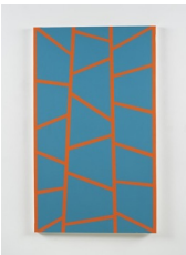
Jeremy Moon 6/73 , 1973 Acrylic on canvas 60 x 35 3/4 inches 152.4 x 90.8 cm