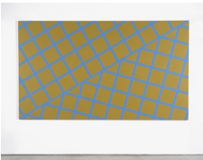
Jeremy Moon Caravan II , 1968 Acrylic on canvas 66 x 114 inches 167.6 x 289.6 cm