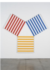
Jeremy Moon Union , 1967 Acrylic on canvas 85 1/2 x 98 1/2 inches 217.2 x 250.2 cm