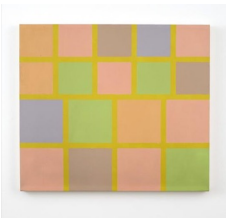
Jeremy Moon 12/69 , 1969 Acrylic on canvas 31 1/2 x 35 7/8 inches (80 x 91.1 cm)