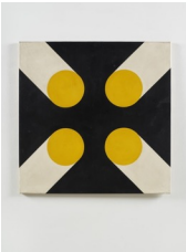
Jeremy Moon Hawk , 1962 Oil on canvas 42 x 42 inches 106.7 x 106.7 cm