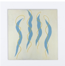
Jeremy Moon Blue Figuration , 1963 Oil on canvas 72 x 72 inches 183.0 x 183.0 cm