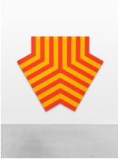
Jeremy Moon Yellow Rose , 1967 Acrylic on canvas 71 x 82 inches 180.3 x 208.3 cm

531 West 24th Street New York NY 10011 tel 212 206 9100 fax 212 206 9055 www.luhringaugustine.com