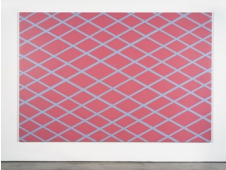
Jeremy Moon Lake , 1971 Acrylic on canvas 83 1/2 x 126 inches 212.1 x 320.0 cm

531 West 24th Street New York NY 10011 tel 212 206 9100 fax 212 206 9055 www.luhringaugustine.com