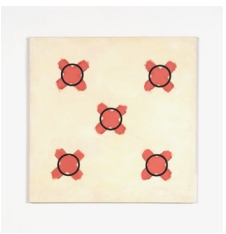
Jeremy Moon Study for Painting with Crosses , 1961-62 Oil on canvas 54 x 54 inches 137.2 x 137.2 cm