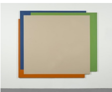
Jeremy Moon 15/73 , 1973 Acrylic on shaped canvas 74 1/8 x 87 3/4 inches 188 x 223 cm