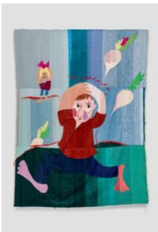
Christina Forrer Turnips Falling, 2022 Cotton and wool 130 x 94 inches (330.2 x 238.8 cm)