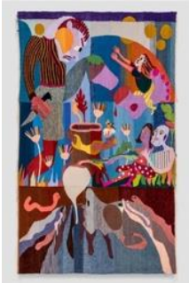
Christina Forrer Turnip Growing, 2022 Cotton and wool 120 x 80 inches (304.8 x 203.2 cm)

17 White Street New York NY 10013 tel 646 960 7540 www.luhringaugustine.com