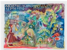
Christina Forrer Between (menschliche Zukunft), 2021 Watercolor and gouache on paper 14 13/16 x 19 7/8 inches (37.6 x 50.5 cm)