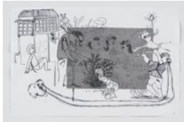
Christina Forrer Cohabitation , 2022 Collage, mixed media 11 x 17 inches (27.9 x 43.2 cm)