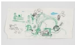
Christina Forrer You, Yay, Misery! , 2022 Pencil on paper 8 x 18 1/4 inches (20.3 x 46.4 cm)