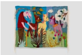
Christina Forrer Ponies in the forest, 2022 Cotton and wool 27 1/2 x 34 inches (69.8 x 86.4 cm)