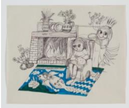
Christina Forrer By the fire, 2022 Pen and marker on paper 14 x 17 inches (35.6 x 43.2 cm)