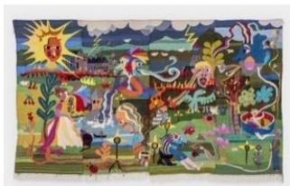
Christina Forrer Sepulcher, 2021 Cotton, wool and linen 97 x 162 inches (246.4 x 411.5 cm)