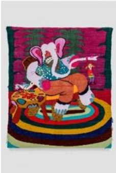
Christina Forrer Elephant on Chair, 2022 Cotton and wool 52 x 42 inches (132.1 x 106.7 cm)