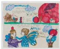
Christina Forrer A is for Apple, 2022 Marker on paper 14 x 17 inches (35.6 x 43.2 cm)