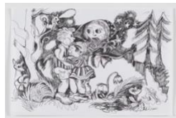
Christina Forrer Alone (in the night in the forest), 2022 Pen on paper 14 x 17 inches (35.6 x 43.2 cm)