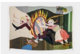
Christina Forrer Gretel, Gretel, 2022 Cotton and wool 72 1/2 x 102 inches (184.2 x 259.1 cm)