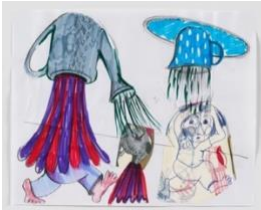
Christina Forrer Untitled, 2022 Collage, marker and pencil 11 x 14 inches (27.9 x 35.6 cm)