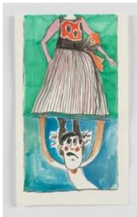
Christina Forrer High Tide , 2021 Watercolor and marker on paper 9 1/4 x 5 1/2 inches (23.5 x 14 cm)