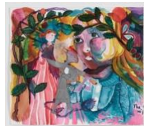
Christina Forrer the ogre's wife needs will eat us if we do not kill her, 2022 Collage, watercolor, and pen on paper 14 1/8 x 16 1/8 inches (35.9 x 41 cm)